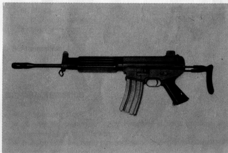
Fig. 2 AR110C RIFLE (Butt Retracted)