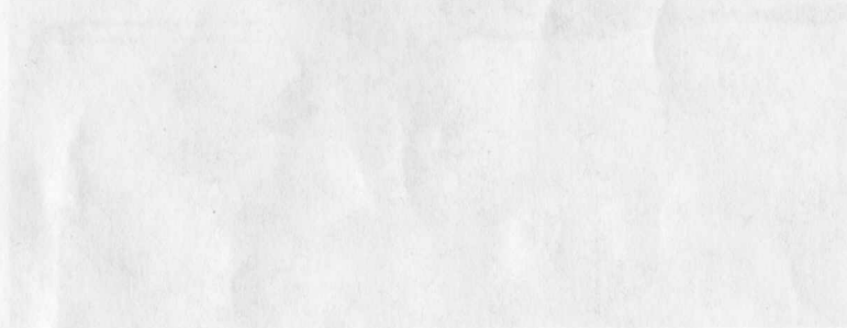
Fig. 1 AR110C RIFLE (Butt Extended)

This manual is made for the information and guidance of personnel whose duties involve the use and maintenance of the 5.56mm AR110C and furthermore to enable him to use it with maximum efficiency.