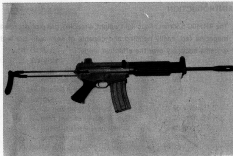
Fig. 1 AR110C RIFLE (Butt Extended)

This manual is made for the information and guidance of personnel whose duties involve the use and maintenance of the 5.56mm AR110C and furthermore to enable him to use it with maximum efficiency.