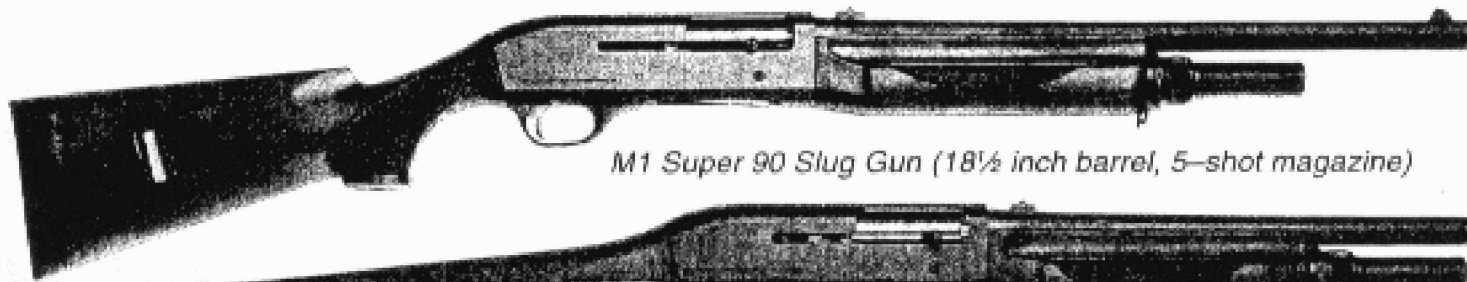
M1 Super 90 Slug Gun (18½ inch barrel, 5-shot magazine)