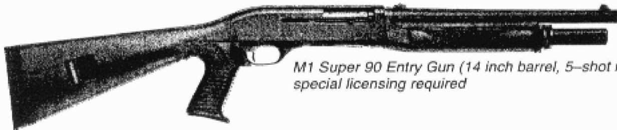
M1 Super 90 Entry Gun (14 inch barrel, 5-shot magazine) special licensing required