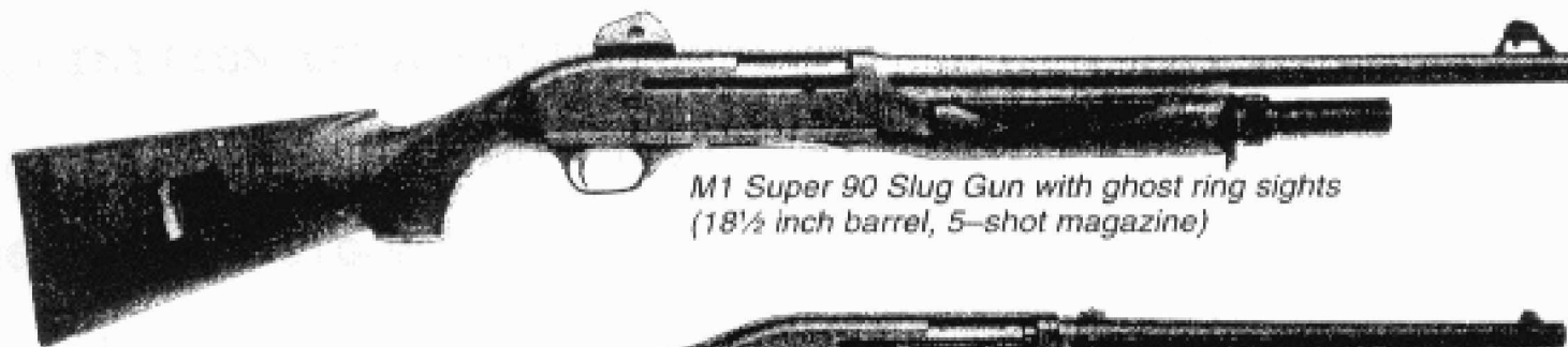
M1 Super 90 Slug Gun with ghost ring sights (18½ inch barrel, 5-shot magazine)